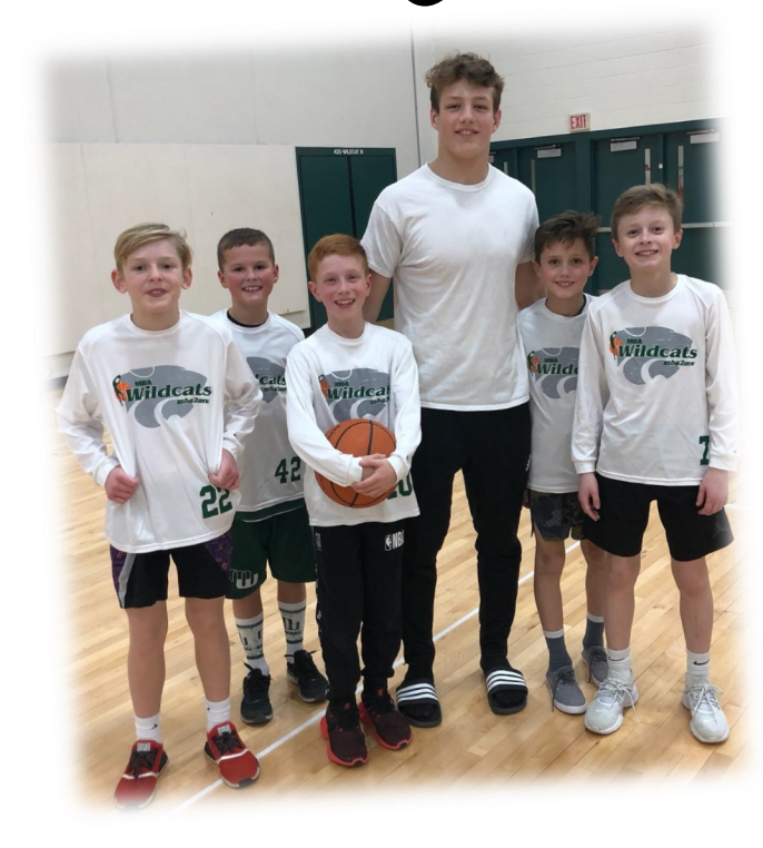
5th Grade Green and White teams were both Skutt Tourney Champions